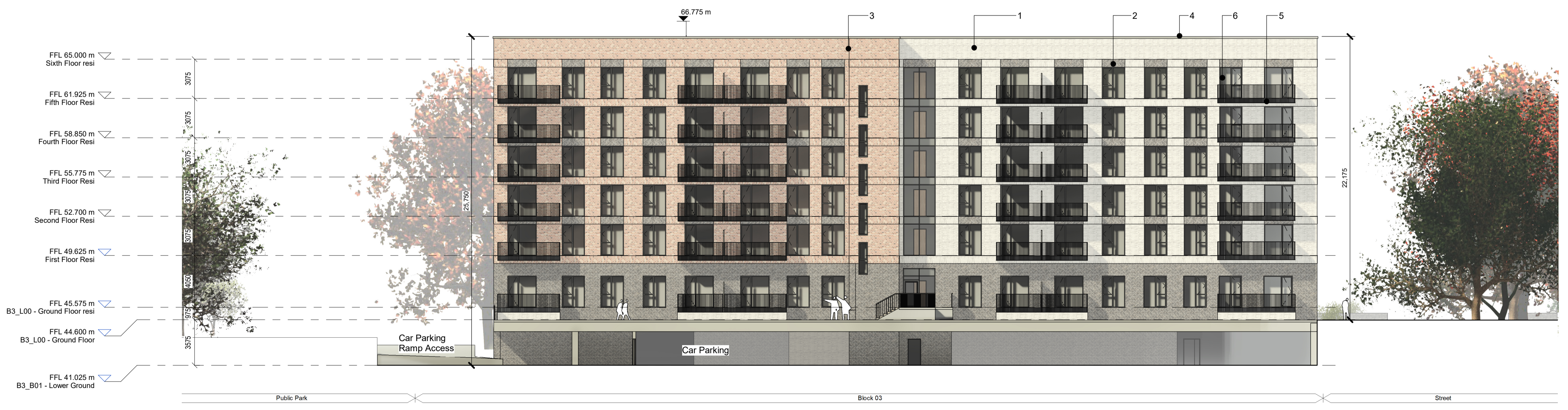
West Courtyard Elevation 1 : 200

Notes: - Do not scale from this drawing. Use figured dimensions in all cases. - Verify dimensions on site and report any discrepancies to the Architect immediately. - This drawing is to be read in conjunction with the Architect's Specification. - © This drawing is copyright and may only be reproduced with the Architect's permission.