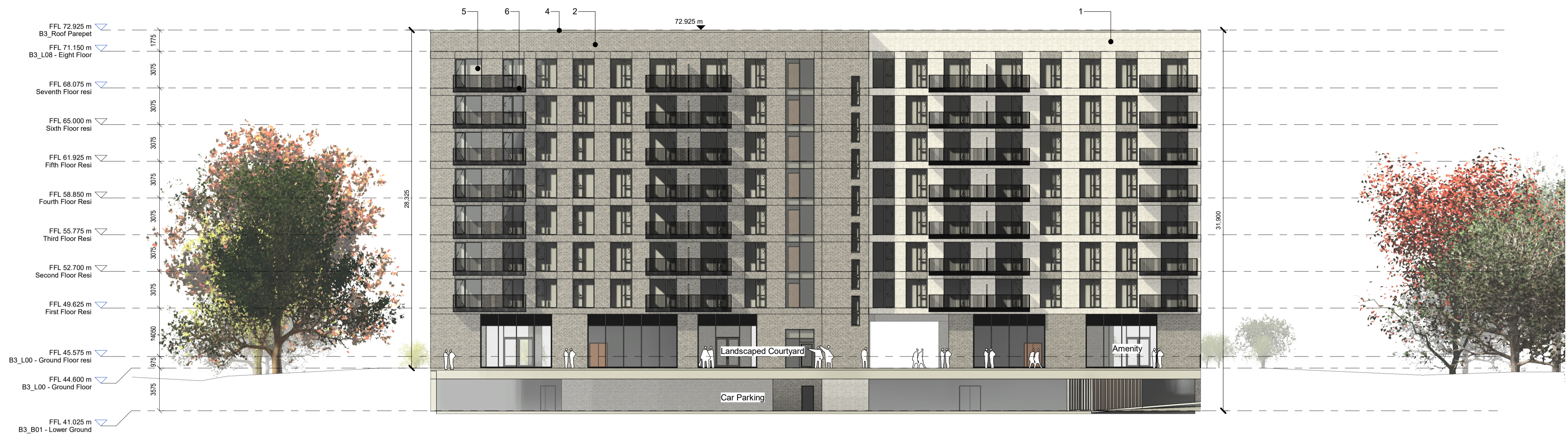
East Courtyard Elevation 1 : 200